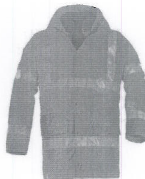
Red / Grey