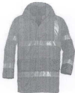
Orange / Navy