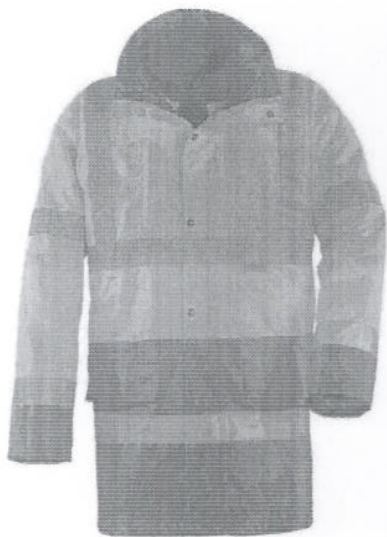
Yellow / Navy