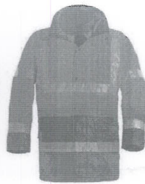
Red / Black