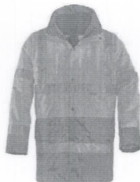
Yellow / Grey