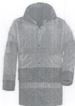
Yellow / Green